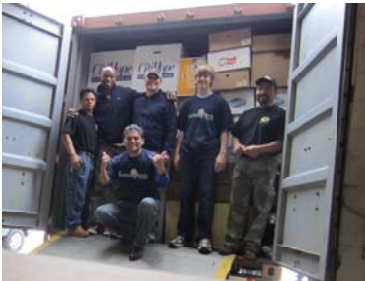
THHF Volunteers sending a container with supplies valued over $2,000,000 to Sierra Leone. Thanks to the generosity of PBI Restoration in Cockeysville, MD for donating the loading dock and volunteers.

Many thanks to Each One Reach One, Direct Relief International, CitiHope, and PBI Restoration for donations and support over the year.