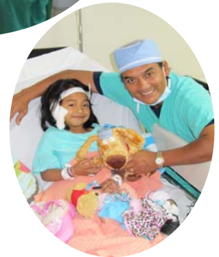
Preparations before surgery to release a restrictive burn will allow this young woman full movement of her arm.