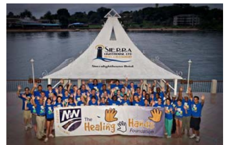
THHF 2011 Sierra Leone Team