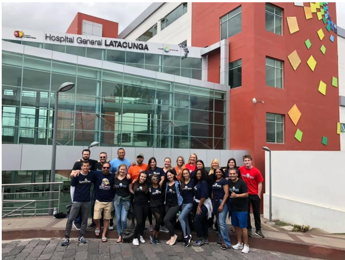
Latacunga, Ecuador Volunteers 2019

The Healing Hands Foundation (THHF) is a non-profit organization founded in 2007 that provides medical services to children and adults around the world. The THHF mission is to provide high quality surgical care to children and adults with complex congenital malformations in areas lacking resources and expertise. The highly skilled medical staff of THHF has decades of combined experience, and its doctors and nurses have practiced medicine in countries around the world, including Ecuador, Colombia, Guatemala, Panama, Dominican Republic, Laos and Sierra Leone. THHF is proud to have the ability to further its mission, due in part to their amazing volunteers, which now includes a core group who are committed to yearly missions in Ecuador and Guatemala